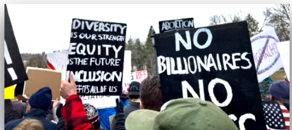
Signs from April 5th Protest in Augusta

Click on the box, picture or underlined text to go to the website or send an email